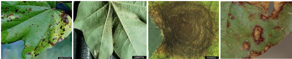
Fig.1 Infected leaves of cotton plant

System success is depends on how accurately system carries operations of machine learning and image processing. The performance can be evaluated by accuracy of machine learning algorithms. To get understanding of various works we carry out survey of different approaches and techniques of machine learning and image processing used for detecting plant diseases. And therefore the quality of product could be increased.