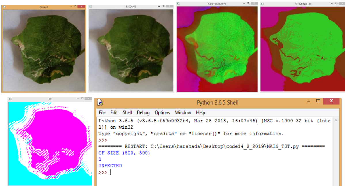
Fig. 4 Results of diseased leaf