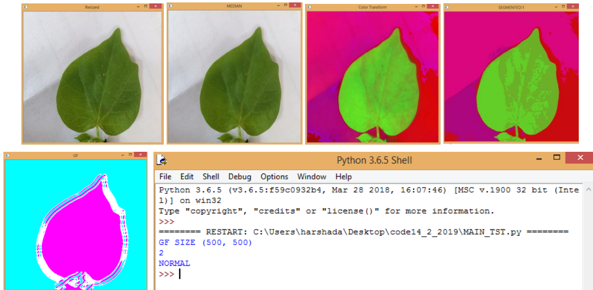
Fig. 3 Results of healthy leaf