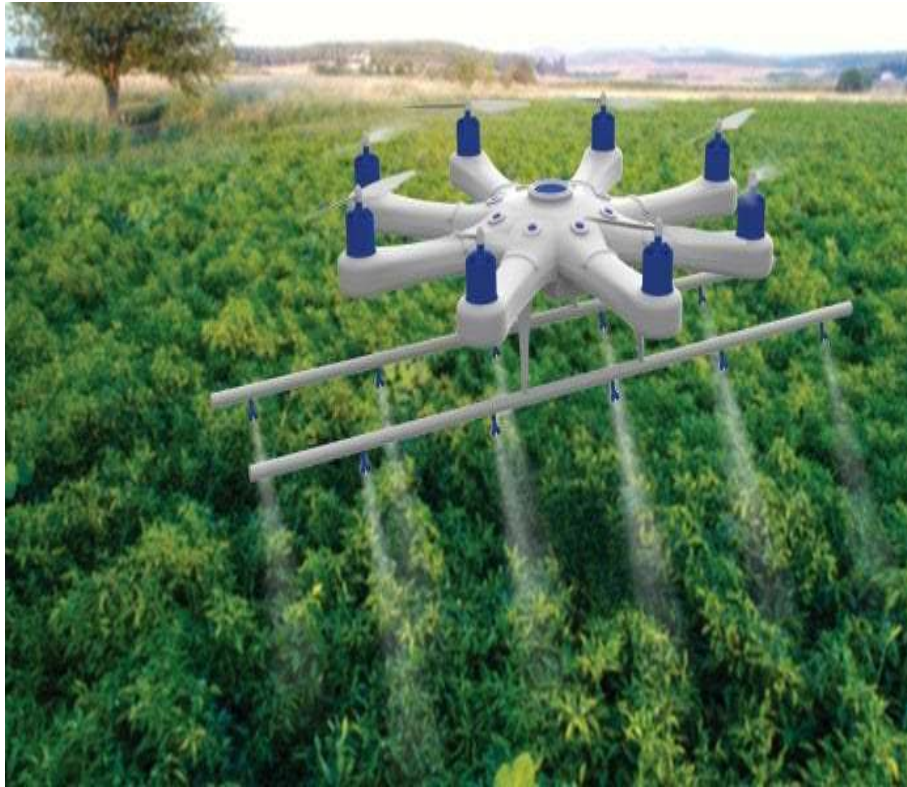
Fig. 8: Industry 4.0 internet of things as aspirant firming with the aid of drone.