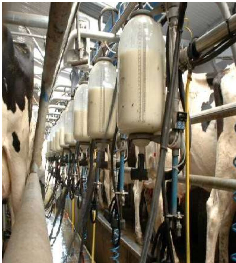
Fig. 7: Industry 4.0 application in the field of dairy farming.