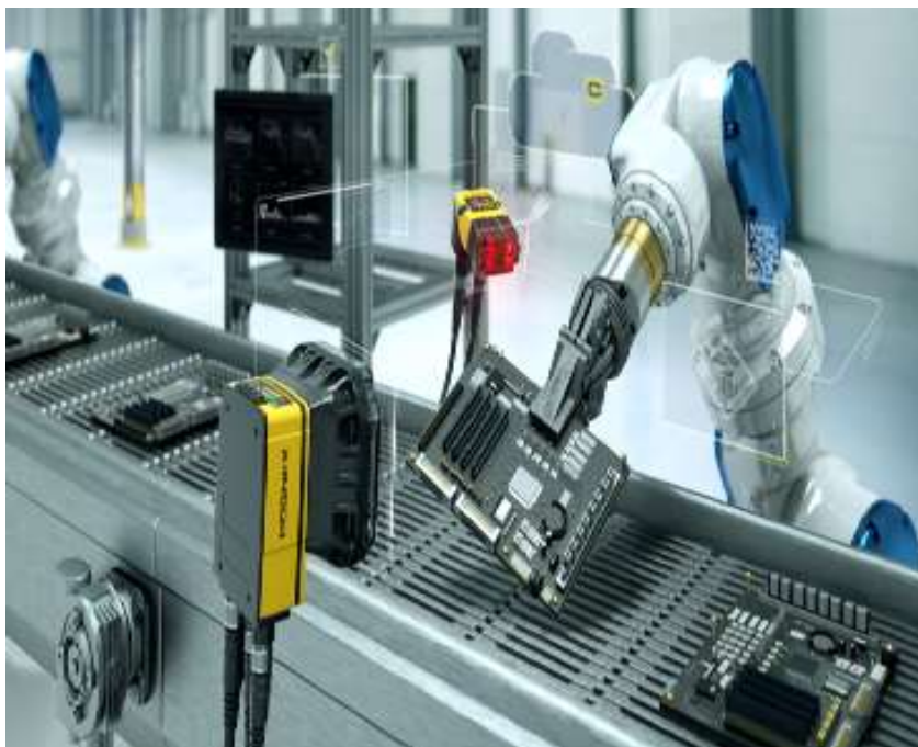
Fig. 5: Delicate items manufacturing and handling.