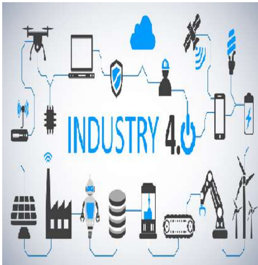
Fig.2: Industry 4.0 utilization of tools and tackles.