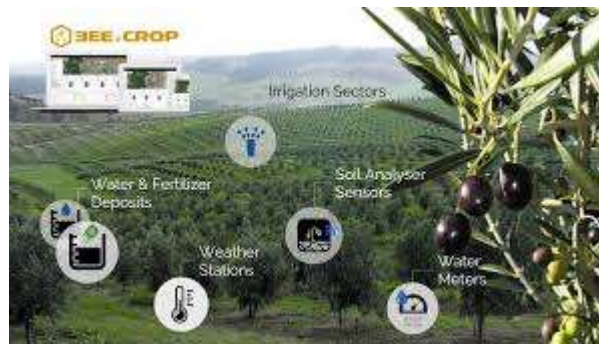
Fig. 10: Smart sensors involvement in irrigation sector.