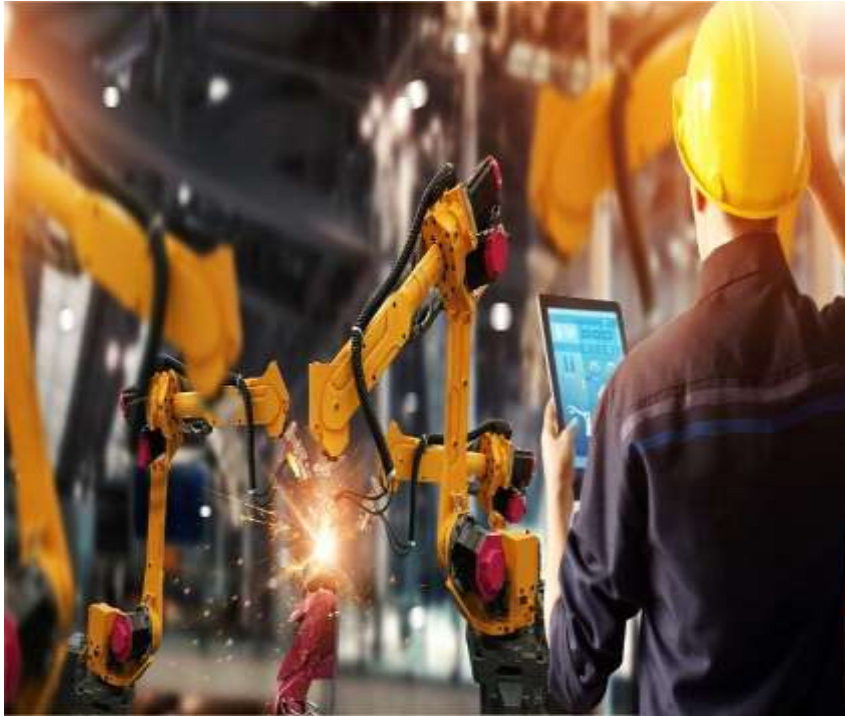
Fig. 4: Manufacturing of tweak products developed virtually.