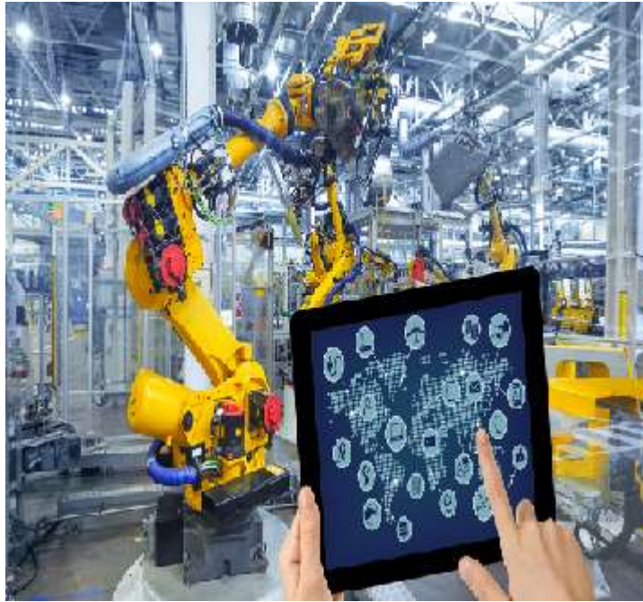
Fig. 6: Digital factory, a smart manufacturing.