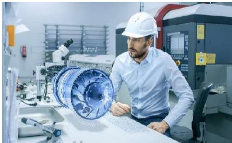
Fig. 3: Manufacturers can test, correct and enhance minute details before proceeding to real-world manufacturing.